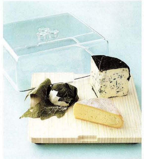
CHEESE BOARD 11¾" by 11¾" by 6", $113, alessi.com CHEESES murrayscheese.com THE CHEESE CHRONICLES $16, Ecco

We asked Thorpe to recommend three for the fall (you may be surprised to learn that many cheeses are seasonal). Her picks are Oregon's Rivers Edge Up in Smoke, a smoked goat cheese wrapped in a maple leaf; Rogue River Blue, a raw cow's-milk cheese aged in pear-brandy-macerated grape leaves, also from Oregon; and Meadow Creek Grayson, a raw cow's-milk cheese with a washed rind, from Virginia. (We think Alessi's covered bamboo board, right, is a lovely way to present them.)